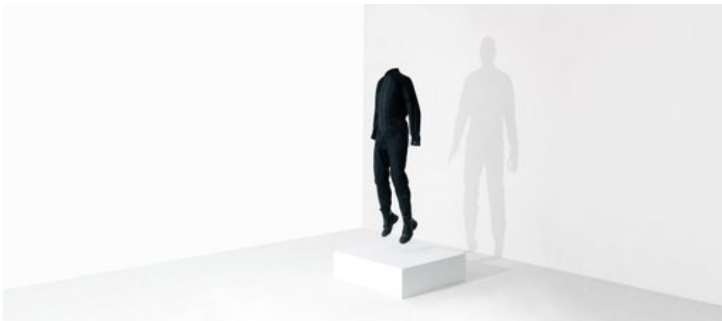
The Virgin Galactic, Y-3 flight-suit and boots

Virgin Galactic and Y-3 announced on Thursday at the Spaceport America in New Mexico the launch of a new partnership to design a complete range of garments for spaceflight operations.